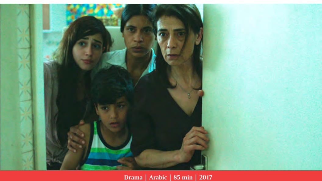
Braina | masic | 05 mm | 2017